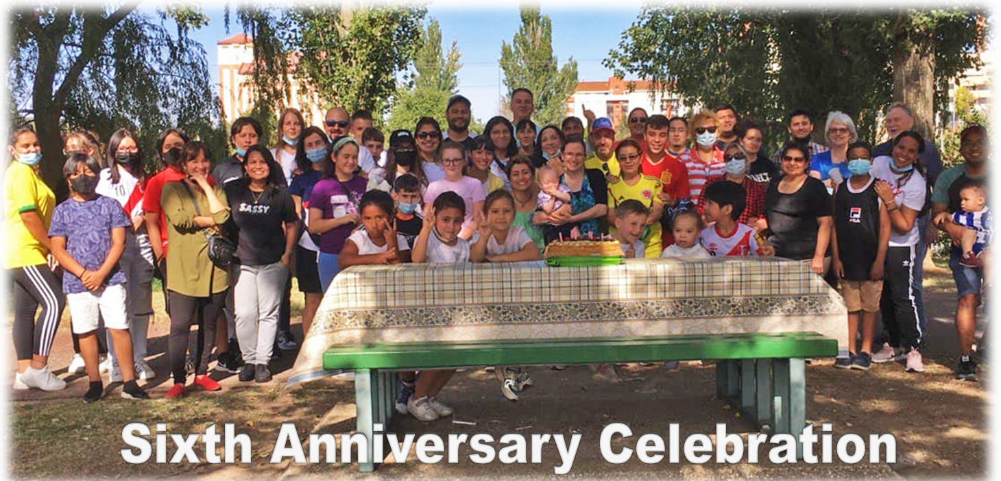
Sixth Anniversary Celebration