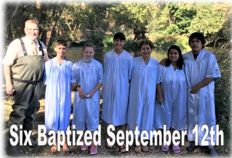
Six Baptized September 12th