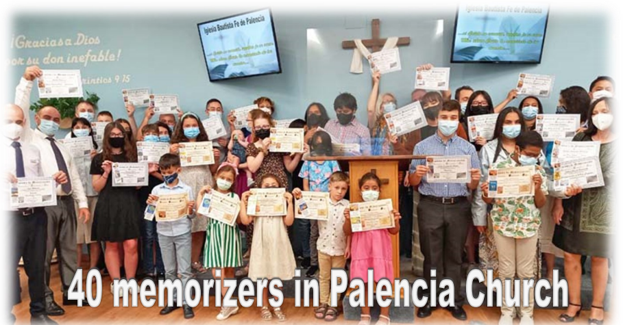
40 memorizers in Palencia Church