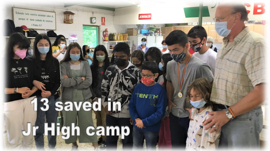
13 saved in Jr High camp