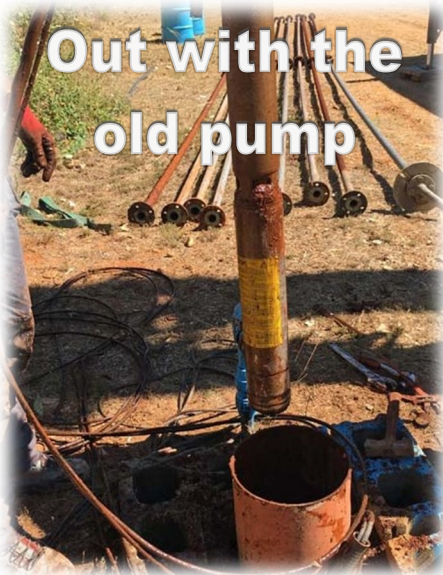
Out with the old pump