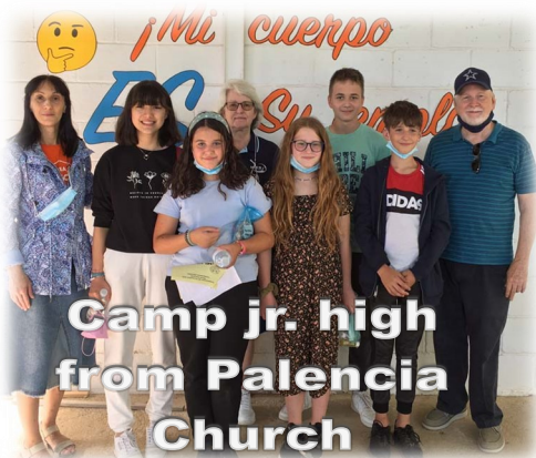
Camp jr. high from Palencia Church