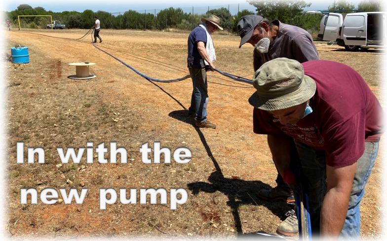
In with the new pump